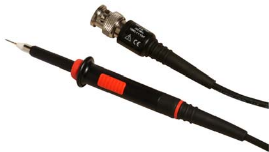
Model 6495 Modular Passive Oscilloscope Probe