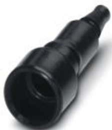
Pneumatic socket, for HC-M-PN3 module, internal hose diameter of 3.0 mm

Please be informed that the data shown in this PDF Document is generated from our Online Catalog. Please find the complete data in the user's documentation. Our General Terms of Use for Downloads are valid ( http://phoenixcontact.com/download )